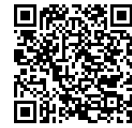
Volunteer Leaflet QR Code

♥ Share this leaflet with your friends and colleagues so they can volunteer and help too.